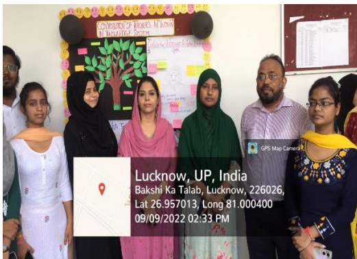
Day 5- Exhibition on Contribution of Teachers in the Indian Knowledge System