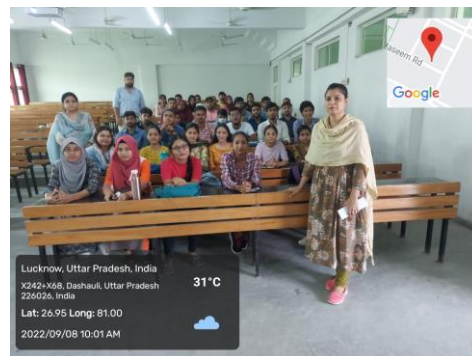
Day 4- Screening of Educational Movies