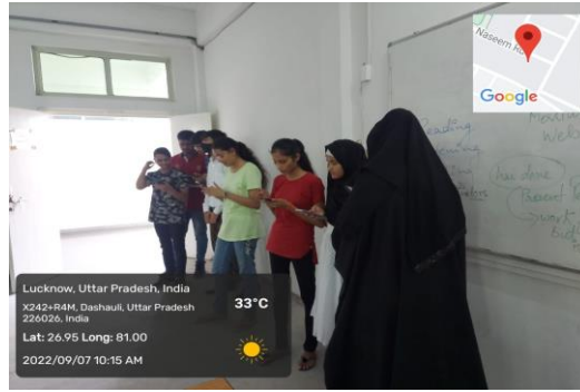
Day 3- Panel Discussion and Book Reading