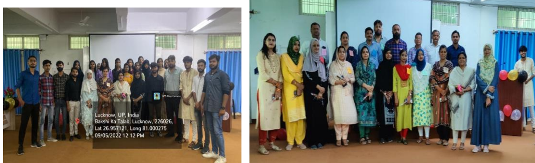
Day 1- Students Felicitation

inspiring the students of the future by Joe Ruhl and Student need to lead the classroom not teachers by Katherine Cadwell were the two movies screened during the event. The fifth and the last day of event i.e. 9 th of September 2022 was dedicated to an Exhibition on “Contribution of Teachers in the Indian Knowledge System” . The students expressed their views through handmade charts reflecting the contribution of eminent teachers in education system from time immemorial. A panel of teachers evaluated the charts and 1 st , 2 nd and 3 rd prizes were given to the students. The event was successfully organized and managed by Dr. Orooj Siddiqui, Dr. Neyha Malik, Dr. Syed Afzal Ahmad and Dr. Aisha Badruddin, the faculty members of the Department of Commerce and Business Management. All the teachers were overwhelmed with happiness as the program was a big success. Students showed their enthusiasm and motivation by showing maximum attendance in all the events, both as the participants as well as an audience.